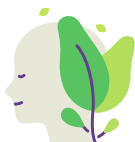
Mental Health Support for Staff & Children