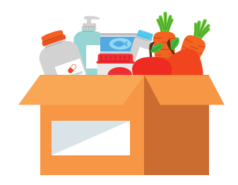
access to food and supplies, linking families to community resources like food and diaper banks