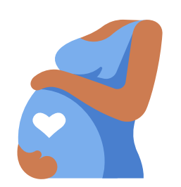
prenatal and postnatal supports, providing wellness checks and a range of services